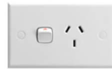
Typical 230volt 10amp Outlet

The standard voltage of supply in New Zealand is 230 volts, 50 hertz. Most hotels and apartments provide 100 volt AC sockets (rated at 20 watts) for electric razors only.